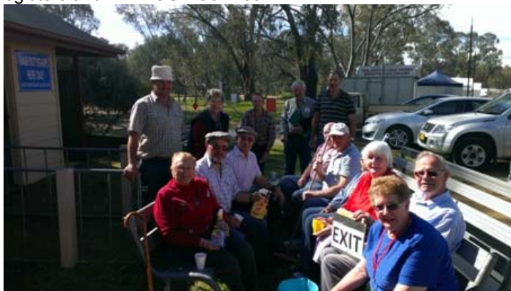
Henty members relax at the conclusion of the Henty Machinery Field Days.

Members of Henty Rotary Club have been kept busy recently. The Henty Machinery Field Days have just celebrated their 50 th anniversary and from the beginning the Rotary Club has manned the Field Day Gates as a fund raiser. Beginning by standing at the entrance to a paddock with nail nags around their waists, they now occupy purpose built gates complete with cash registers and EFTPOS machines.